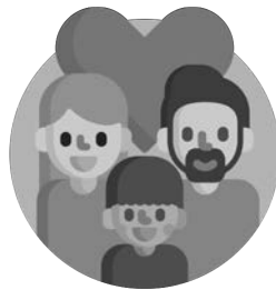
loss of parental coverage