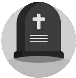
death of a family member