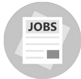
spouse gains or loses coverage